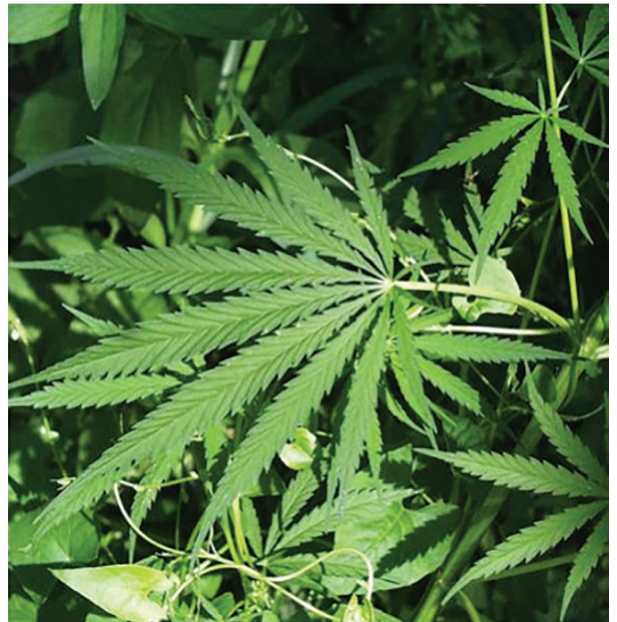
Figure 1. Marijuana plant. (quoted from Salihoğlu Z, Anesthesia in the Drug-Using Patient. İstanbul University-Cerrahpaşa, Cerrahpaşa Faculty of Medicine, Department of Anesthesiology and Reanimation Residents' Training Seminar 2013)

Although it has no proven teratogenic effects among pregnant women, in cases of chronic use, it may cause uteroplacental circulatory disorders, intrauterine growth