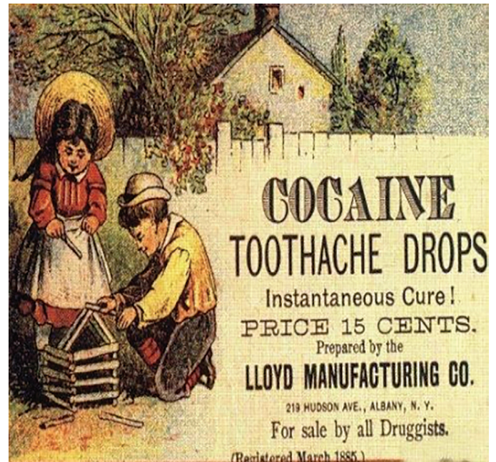
Figure 4. Cocaine drip advertisement aimed at reducing toothache. (quoted from Salihoğlu Z, Anesthesiain the Drug-Using Patient. İstanbul University-Cerrahpaşa, Cerrahpaşa Faculty of Medicine, Department of Anesthesiology and ReanimationResidents' Traning Seminar 2013)

Infections (tuberculosis, AIDS, Staphylococcus aureus ), aspiration pneumonia, lung abscess, septic embolism, pulmonary edema, barotrauma, pneumonic lung infiltrates, vasculitis, pulmonary infarction, pulmonary hypertension, and gas exchange disorders may occur in the respiratory system due to cocaine use (26).