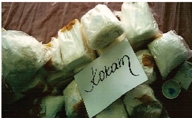
Figure 3. Sample of cocaine in powder form. (quoted from Salihoğlu Z, Anesthesiain the Drug-Using Patient. İstanbul University-Cerrahpaşa, Cerrahpaşa Faculty of Medicine, Department of Anesthesiology and ReanimationResidents' Traning Seminar 2013)

It has stimulating and addictive properties in the central nervous system. It prevents the reuptake of dopamine, norepinephrine, and serotonin. Severe hypertension may occur during laryngoscopy. To reduce this complication, nitroprusside, nitroglycerin, and calcium channel