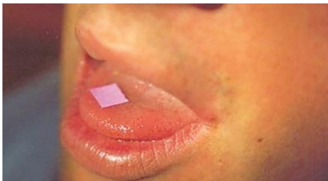
Figure 8. LSD (Lysergic acid diethylamide) sample. (quoted from Salihoğlu Z, Anesthesia in the Drug-Using Patient. İstanbul University-Cerrahpaşa, Cerrahpaşa Faculty of Medicine, Department of Anesthesiology and Reanimation Residents' Training Seminar 2013)

Anesthesia is extremely risky due to autonomic dysregulation, cardiomyopathy, large changes in blood pressure, and tachycardia caused by these substances. The risk of cerebral and coronary vasospasm is high. Arterial vasospasm, arrhythmia, myocardial ischemia, myocardial infarction, and non-hemorrhagic cerebral vascular events may be observed among users of these substances (44). Vasopressors such as ephedrine should be used with caution due to their exaggerated response to sympathomimetics.