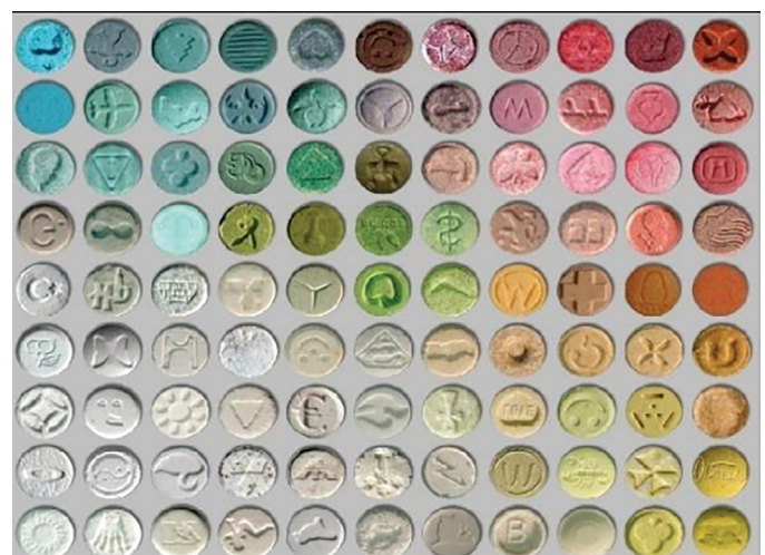
Figure 5. Various samples of ecstasy. (quoted from Salihoğlu Z, Anesthesia in the Drug-Using Patient. İstanbul University-Cerrahpaşa, Cerrahpaşa Faculty of Medicine, Department of Anesthesiology and Reanimation Residents' Training Seminar 2013)

Morphine, codeine, meperidine, fentanyl, methadone, and heroin are some of the opioids that are commonly