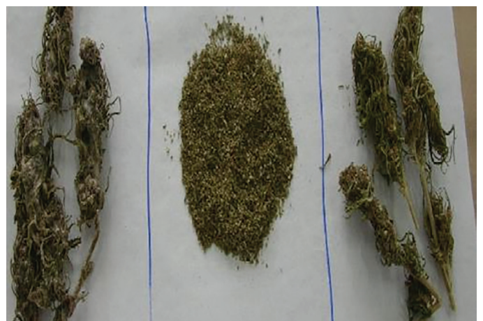
Figure 2. Indian hemp plant and powdered version. (quoted from Salihoğlu Z, Anesthesia in the Drug-Using Patient. İstanbul University-Cerrahpaşa, Cerrahpaşa Faculty of Medicine, Department of Anesthesiology and Reanimation Residents' Training Seminar 2013)