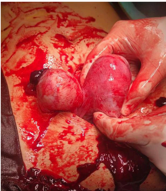
Figure 1. Ruptured uterine horn

Müllerian agenesis/hypoplasia can lead to the development of congenital anomalies in the uterus, hymen, or vagina (e.g., unicornuate uterus), whereas fusion defects can result in the formation of uterus didelphys, bicornuate uterus, and/or vaginal septum. Additionally, in patients with Müllerian anomalies, 20% to 30% of them have kidney anomalies (7). These conditions commonly lead to gynecological complaints such as dysmenorrhea, dyspareunia, endometriosis, and infertility. Hematometra can develop in a rudimentary horn, which can be mistaken for a pelvic mass. Endometriosis can occur because of retrograde