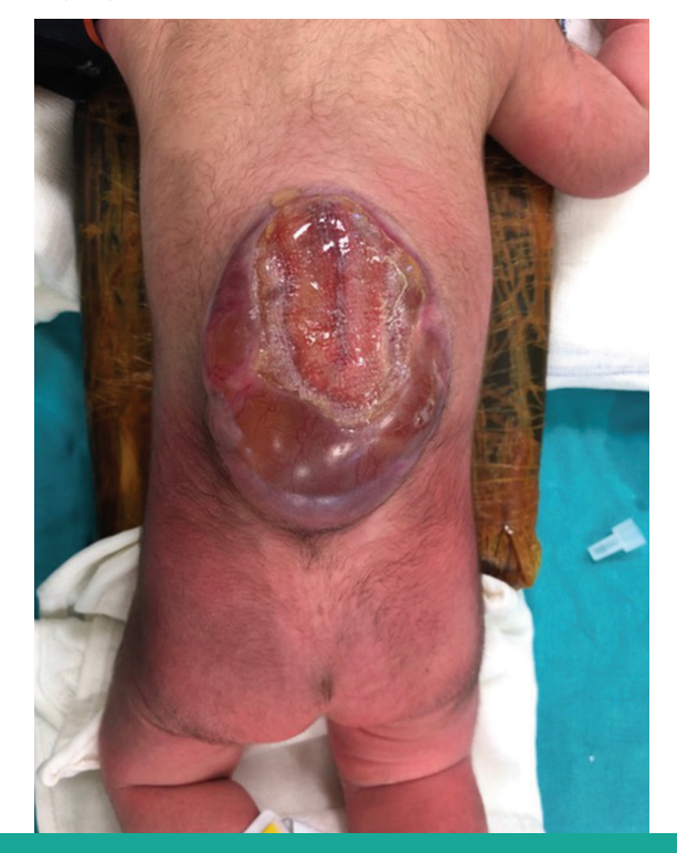
Figure 1. Preoperative view of a giant thoracic mass

The dural tissues were dissected from the base of the sac and primarily sutured by making a tube around the neural tissue. After that, it was ensured that there was no CSF leak by applying positive pressure.