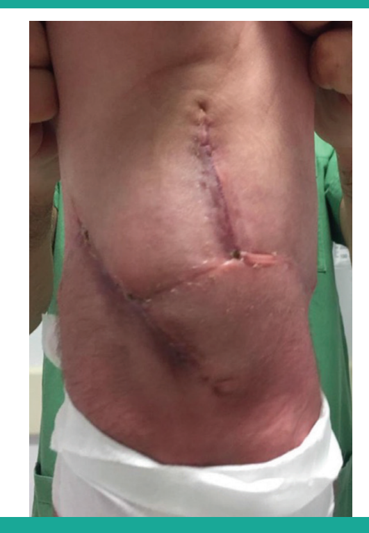
Figure 4. The defect area healed smoothly in the late postoperative period