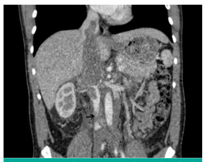
Figure 1. Tomographic examination indicating thrombosis in vena cava inferior

After uneventful postoperative period, histopathologic examination indicated pure embryonal carcinoma (Figure